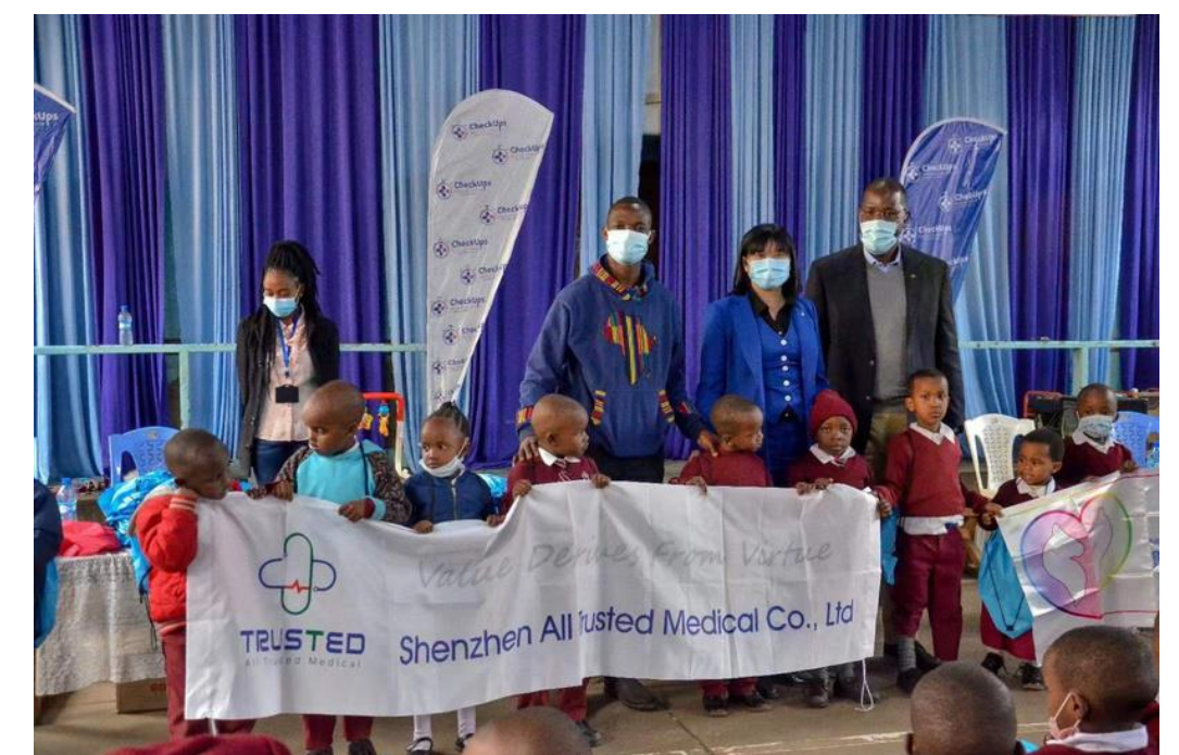
Social Responsibility: Donation to MOH, NGOs, Military and School etc.