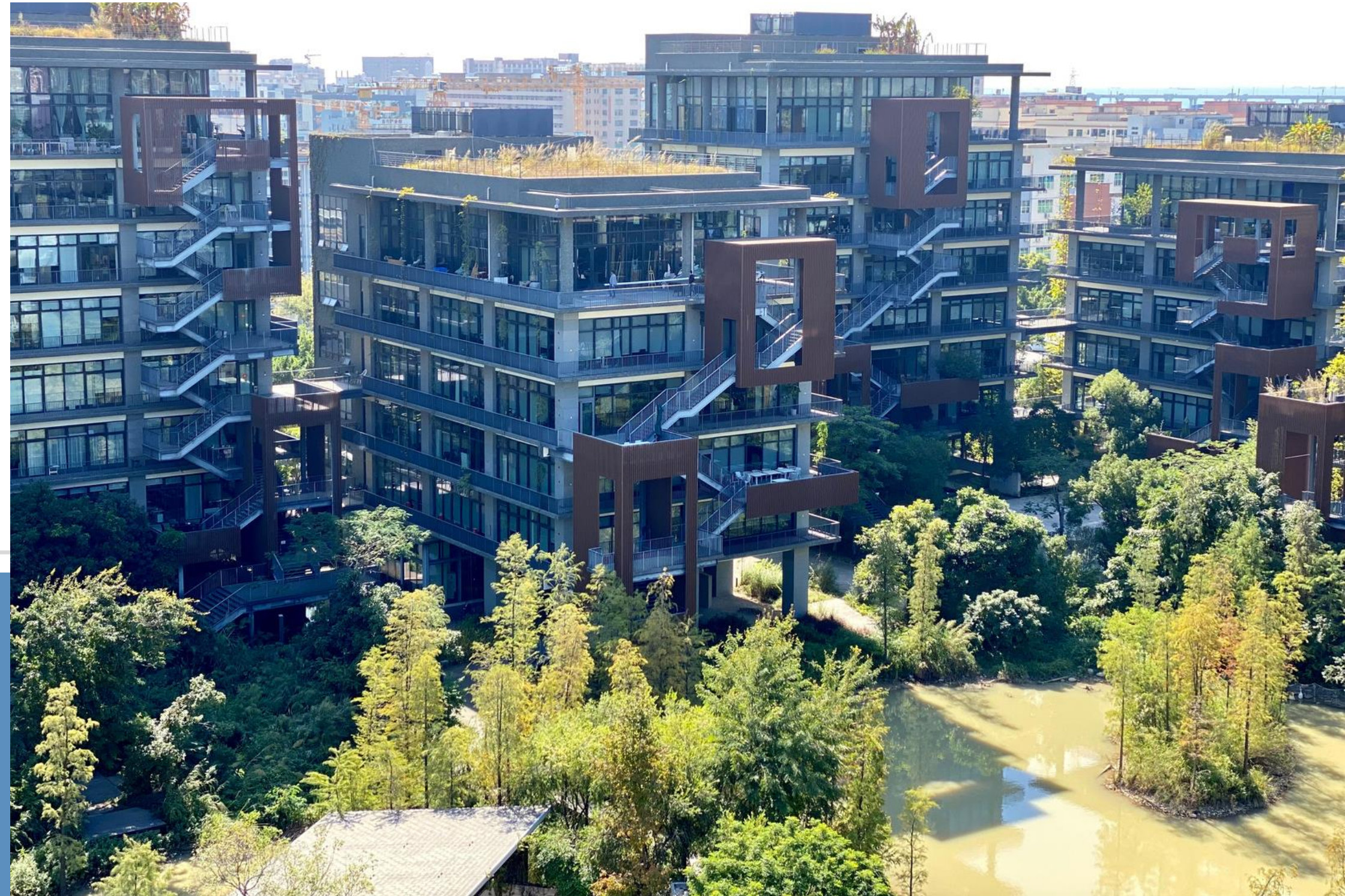
Wutong Island Shenzhen, China